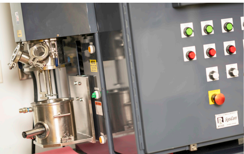
» Mixing conditions and the related equipment have a strong impact on the electrode slurry.

Dürr Megtec is an OEM. Its patented technologies have made it a global leader in providing engineering and manufacturing solutions that optimize advanced manufacturing methods.