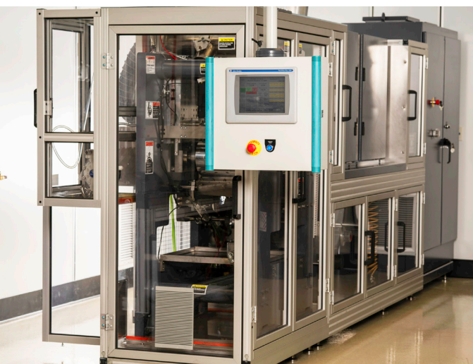
» The BIC lab coater is easy-to-use and designed specifically for short production runs.